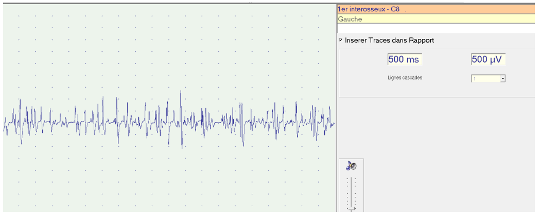
Figure 4: Neurogenic tracing at the 1<sup>st</sup> left interosseous