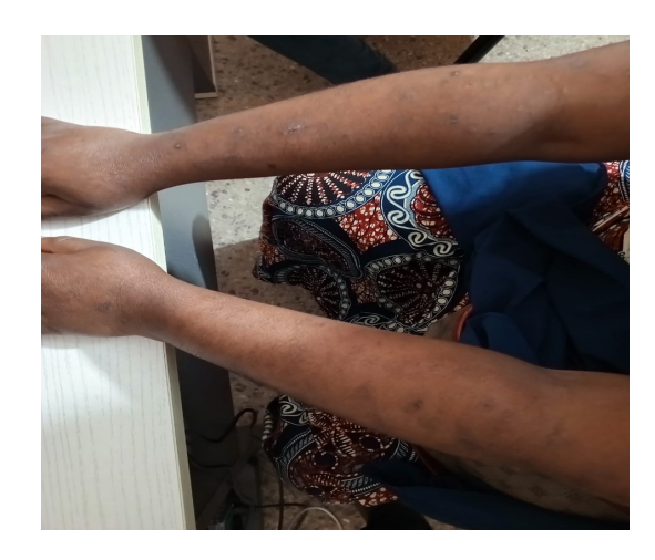
Figure 3: Pigmented macules sequellary to the upper limbs